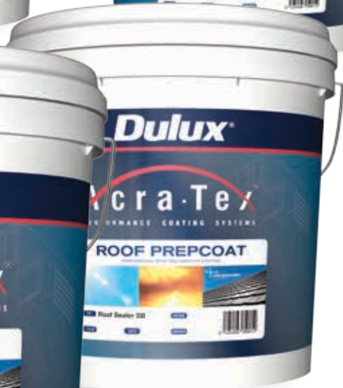
AcraTex Roof Sealer SB