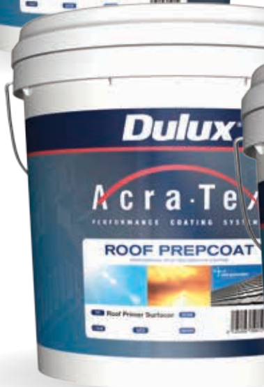
AcraTex Roof Primer Surfacer