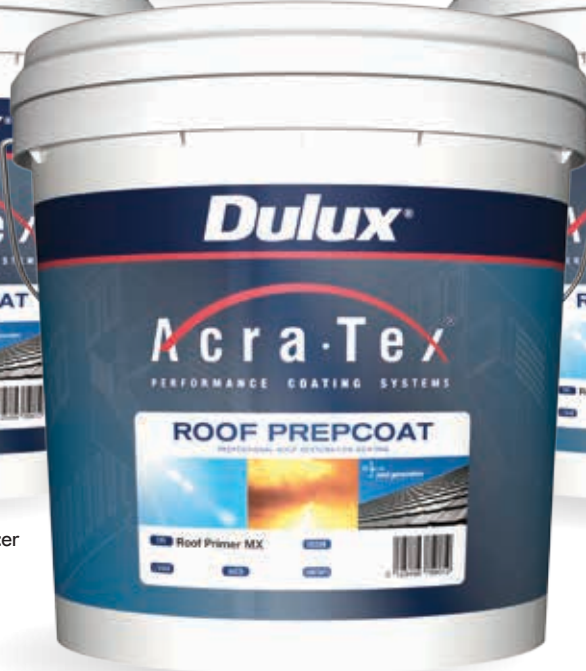
AcraTex Roof Primer MX